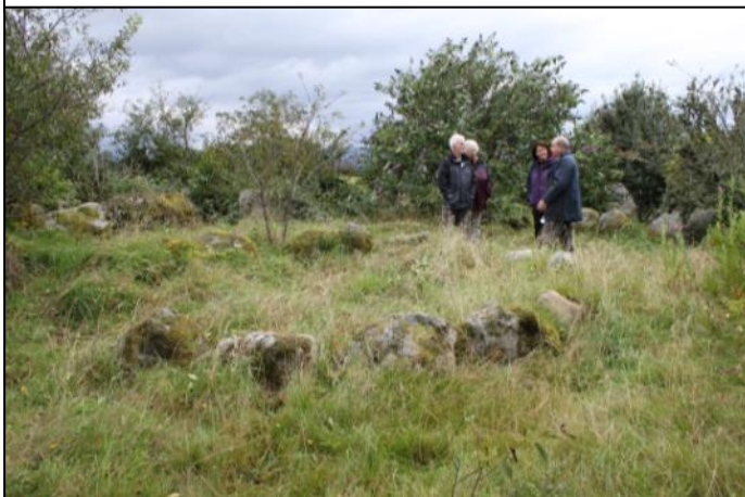
Carn Irenan—October Site of the Month. For more information see www.archhighland.org.uk

All lectures will be in Dingwall Community Centre at 7:30pm and will be followed by coffees and teas. Suggested donation of £3 per lecture.